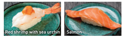
Red shrimp with sea urchin